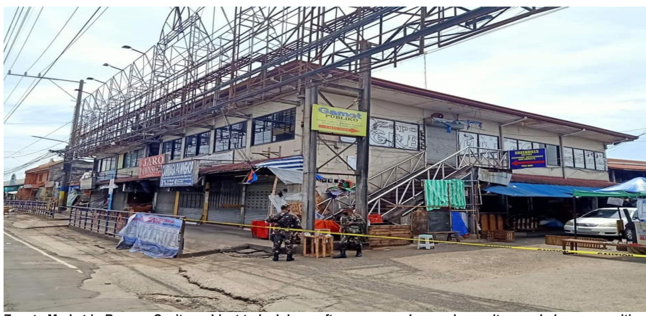
Zapote Market in Bacoor, Cavite, subject to lockdown after some vendors and security marshals were positive in COVID-19 This will last until August 18