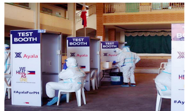
First day of Expanded Targeted Mass Swab Testing has been conducted in Bacoor City.