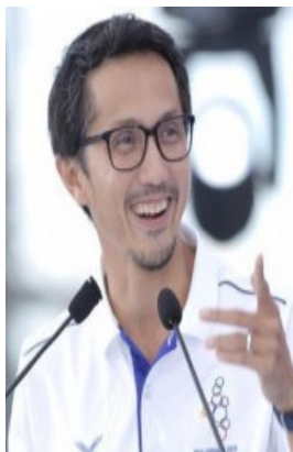
BCDA Chairman Sec. Vince Dizon

BACCOOR CITY, Cavite (PIA) --The city government here thru its City Task Force Against COVID-19 launched the Expanded Targeted Mass Swab Testing (ETMST) in the city August 6, 2020 at Bacoor National High School Tabing Dagat and at Zapote Elementary School.