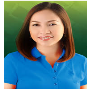
Mayor Jenny Austria-Barzaga

ANY VIOLATION OF THE ABOVE GUIDELINES WILL BE A CAUSE FOR SUSPENSION OR CANCELLATION OF FRANCHISE.