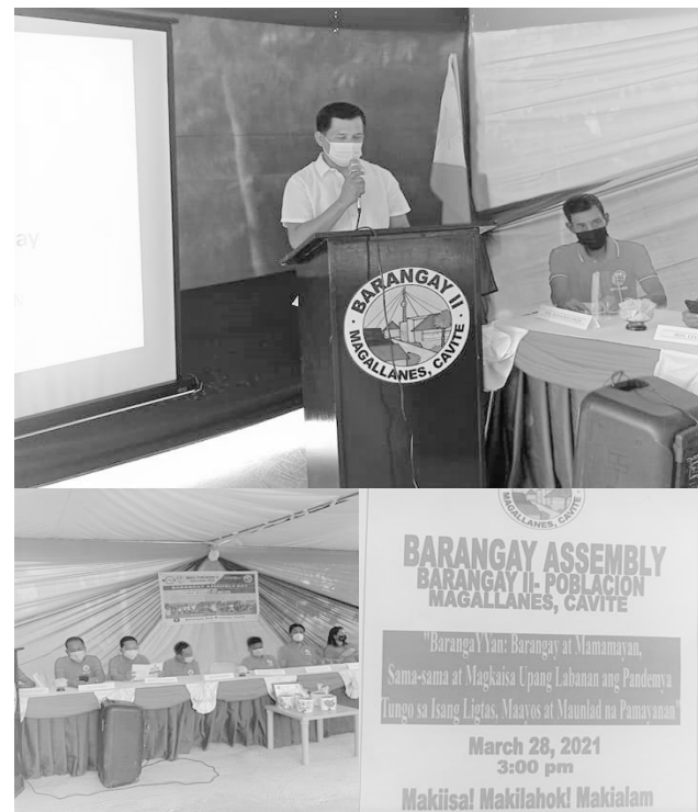
March 28, 2021 3:00pm onwards Barangay Assembly Day at Barangay Dos Magallanes Cavite

The S-PaSS is a system that will also provide the LGUs real-time monitoring of all incoming travelers to the respective localities while the system will also provide the travelers their travel history.