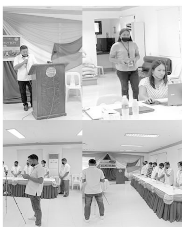
March 27: Barangay Assembly Day at Barangay Bendita 1.