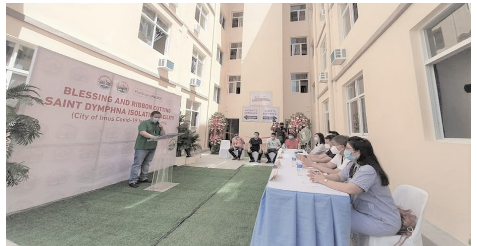
St. Dymphna Isolation Facility in Barangay Palico IV, Imus City, Cavite

First, the vaccination site at the Ospital ng Imus where the official rollout of the vaccination was held, second, the CoViD-19 Drive-Thru Vaccination Site at the Robinson's Place Imus, and third, the Onsite CoViD-19 Vaccination/Mobile Vaccine Clinic, and lastly, the upcoming conduct of house-