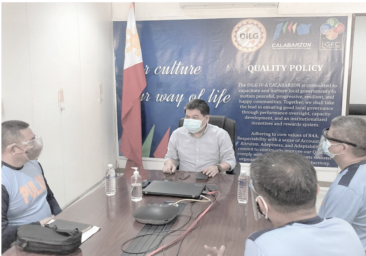
Coordination Meeting of the DILG IV-A Top Management last March 25 with PNP PRO4A re: DILG IV-A Vaccination Plan and the establishment of DILG IV-A's medical and dental services for the welfare and benefits of its employees. This initiative is in collaboration with the Philippine National Police- Police Regional Office (PNP PRO) IV-A and the Bureau of Jail Management and Penology (BJMP) IV-A's medical personnel.