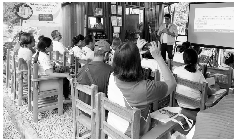
PGS group in the province of Rizal. The training will run until February 21, 2025.

The DA-ATI CALABARZON, in partnership with the DA-Regional Field Office IV-A, is currently conducting the "Training of Trainers on Participatory Guarantee System (TOT on PGS) Phase II" for Marikina Watershed Kaysakat Association (MARIWSKA).