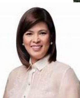
Cong. Lani Mercado Revilla

tylist, the 1st District City Councilors, SK President