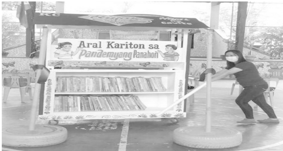
Ramona S. Tirona Memorial School, SDO Dasmariñas City RSTMS Library is now rolling. Come and see us on May 21, 2021 from 1pm-2pm at our covered court. You can borrow books of your choice following the health protocols.

The devotion of teachers when it comes to their profession is truly non-negotiable. Will fulfill the sworn duty for VPVians, with or without return.