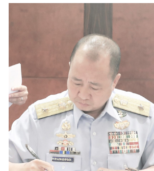
PCG Commodore Leovigildo Panopio

Panopio said the new water assets will "greatly help" in intensifying the presence of the