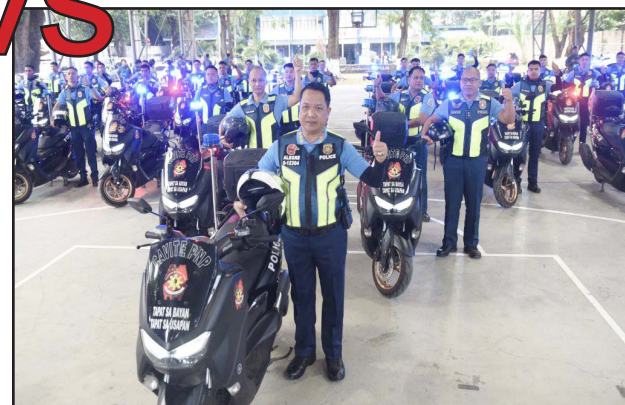
Cavite Provincial Police Office (PPO) "Patruyang Magilas," February 14, combines increased police presence with quick and effective intervention in criminal incidents.

program, or the Revitalized Patrol Operations and Neighborhood Watch to Deter Crimes and Public Safety Incidents through Aggressive Police Presence.