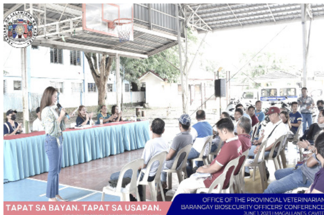
OFFICE OF THE PROVINCIAL VETERINARIAN BARANGAY BIOSECURITY OFFICERS' CONFERENCE JUNE 1, 2023 | MAGALLANES, CAVITE