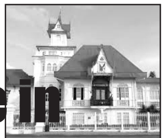
Mayor Strike Revilla

Kauna-unahang Fire and Rescue Village sa Pilipinas na matatagpuan sa Bacoor, magsisilbing life safety training center ng mga kabataan patungkol sa disaster and emergency response.