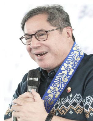
Health Secretary Teodoro Herbosa

CAVITE CITY (PIA) – A new 100-bed 3-storey mega health center in Cavite that will cater to the needs of a growing population in Cavite's 1st district aims to ease overcrowding in hospitals.