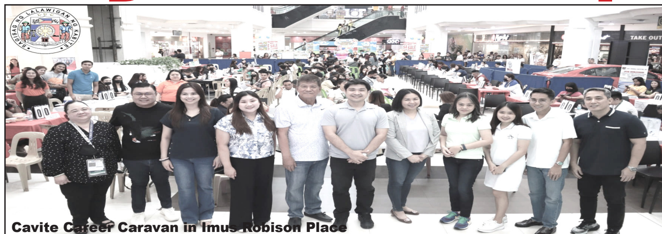
Cavite Career Caravan in Imus Robinson Place