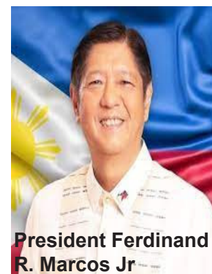
President Ferdinand R. Marcos Jr

MANILA -- Determined to address traffic congestion in Metro Manila, President Ferdinand R. Marcos Jr. vowed on Sunday to develop nearby provinces and cities as part of the administration's long-term solution to the traffic problem in the metropolis.