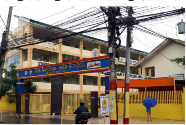
Imus National High School