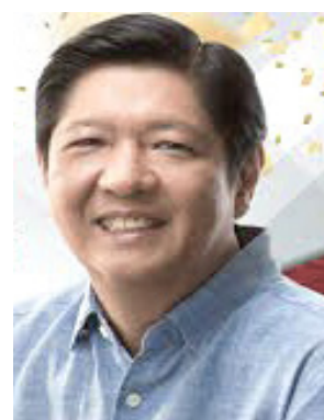
Pres. "Bongbong" Marcos Jr.

President Marcos added that the government will focus on