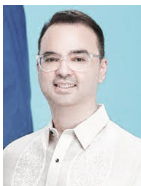
Sen. Alan Peter Cayetano

"Kapag sinabi mong power, it's basically the ability to get someone else to act the way