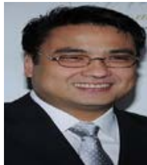
SEN. BONG REVILLA, JR.

When the procurement involves national security interest, the DND Secretary, upon the approval of the President, may pre-