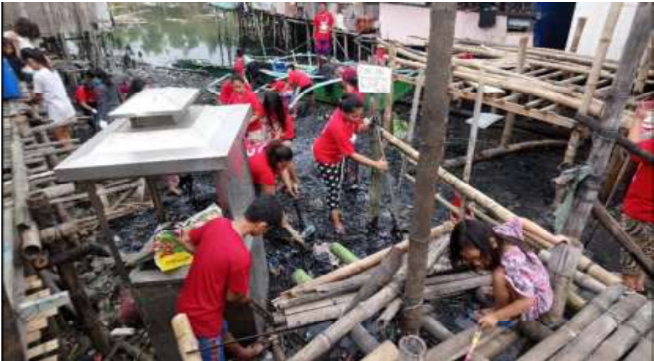
CLEAN-UP. Multi-sector volunteers join the massive and simultaneous clearing and clean-up of garbage and illegal structures that breach into the Zapote River, during the kick-off of the Department of Environment and Natural Resources' (DENR) “#Battle for Manila Bay” Rehabilitation Program, Jan. 27, 2019.