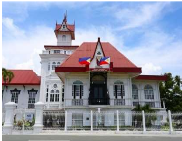
NATIONAL ARTS MONTH. Museo ni Emilio Aguinaldo located at the ground level of the iconic Emilio Aguinaldo Shrine is set to stage a series of activities and events this February in celebration of 'National Arts Month', and as prelude to the 150th birth commemoration of Gen. Emilio Aguinaldo on March 22, 2019.