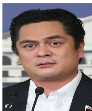
PCOO Secretary Martin Andanar

IMUS CITY, Cavite -- Presidential Communications Operations Office (PCOO) Secretary Martin Andanar took the time to sit down and have lunch with Cavite's media practitioners recently to learn about their concerns, as his 'Press Freedom' caravan went on its Cavite leg at the Gerry's Grill and Restaurant, District Mall. The PCOO chief has been meeting with jour-