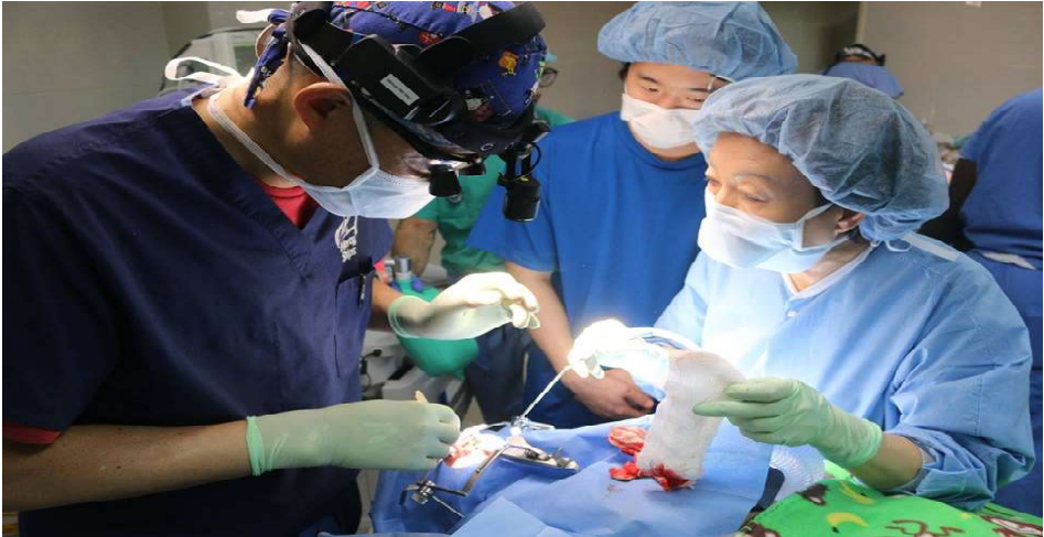
Libreng operasyon hatid ng Glendale Korean Adventist Medical Mission Team (GKAMMT), Sahmyook University, Rotary Club of Makati Central at Philippine American Group of Educators and Surgeons (PAGES) sa ating Ospital ng Imus noong nakaraang Feb.1.

“Presidential Task Force on Violations of the Right to Life, Liberty and Security of the members of the Media” “Kung no. 1 ito, ibig sabihin n’yan e priority kayo (If this is no. 1, that means you’re the priority),” he said.