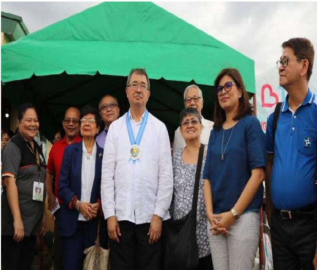
Bacoor City Mayor Lani Mercado Revilla and city government officials welcomed Department of Science and Technology (DOST) Secretary Fortunato dela Peña on his visit to the City of Bacoor yesterday. Secretary dela Peña made tours of the Mussel Depuration Center in Alima, the Sineguelasan Food Processing Center in Sineguelasan, and a machinery factory in Aniban. DOST has been very supportive of the city’s various initiatives in science and technology.