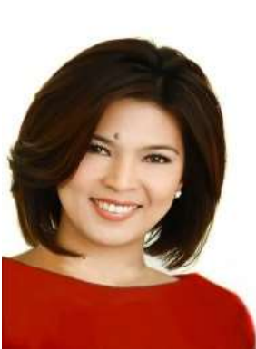
Mayor Lanie Mercado Revilla

also participated in the simultaneous clean-up drive especially those along coastal areas and river banks like in Ilang-Ilang River and the Rio Grande River in Barangay Manggahan-San Francisco area; and Tanza River in Barangays San Juan 1 and 2 and Tejero in General Trias City; and in Barangay Sapa 3, Kanluran, Bagbag I, Wawa 1 & 3 and Silangan, Isla Bonita in the municipality