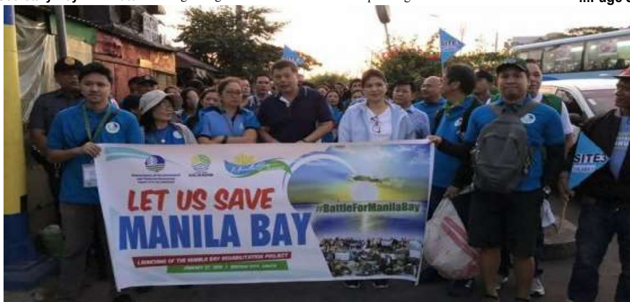
Joining the Cavitenos with Cavite Governor Boying Remulla and Bacoar City Mayor Lani Mercado Revilla leading the clean-up activity. Organized by Department of Environment and Natural Resources (DENR).