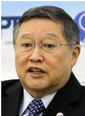
Finance Secretary Carlos Dominguez III

The Commissioner added that since 97% of its revenues come from voluntary compliance and 3% from law enforcement, the bureau will intensify its focus on law enforcement through intensified Audit and Investigation and will continue with its current program of Oplan Kandado, RATE Program and Comprehensive taxpayer profiling and industry benchmarking activi-