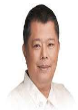
Gov. Jesus Remulla

CAVITE CITY, Cavite (PIA) – The Provincial Government of Cavite's Ugnayan sa Barangay continues to bring government services to different barangays in the province with the recent distribution of modern tricycles called "bokyo" at Samonte Park here in the city. Former Governor Jonvic Remulla represented his brother Governor Jesus Crispin "Boying" Remulla in giving out seventy six (76) bokyos to several barangays which will be used as patrol vehicles when they do the rounds especially during early morning hours. The said vehicles were intended to aid the recipient barangays in monitoring their peace and order situation, and to immediately response to emergencies.