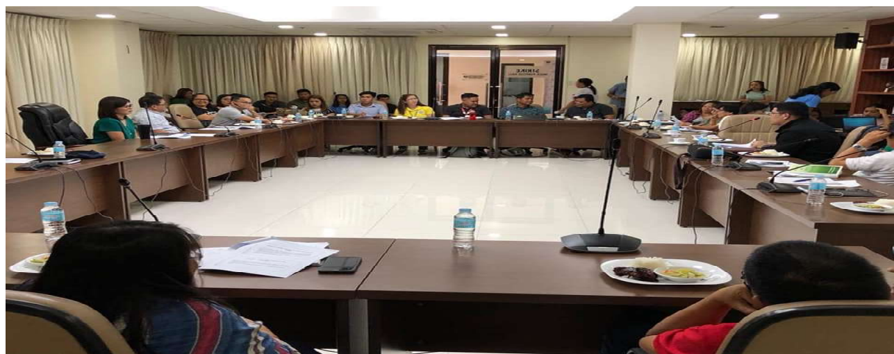
The City Government of Bacoor, led by Mayor Lani Mercado Revilla, participated in the coordination meeting between ACENRO and the Land Management Bureau-DENR regarding Manila Bay Strategies.