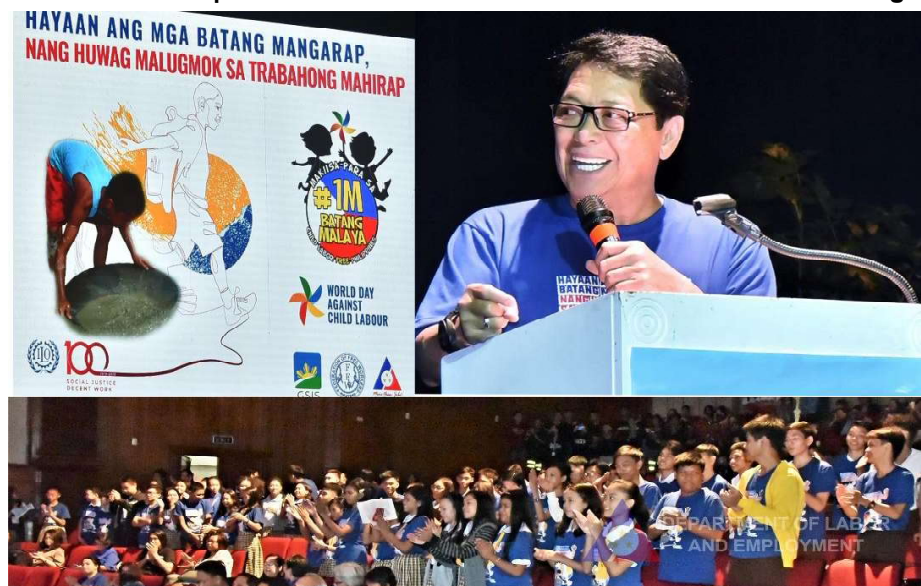
Labor Secretary Silvestre Bello III leads the observance of World Day Against Child Labor at the GSIS Theater in Pasay City.

Apart from the nationwide profiling, DOLE has also provided livelihood assistance in form of ...Page 4