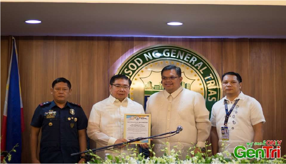
The City of General Trias Peace and Order Council was given recognition for its performance in the 2018 Peace and Order Council Performance Audit, The council exhibited remarkable effort in addressing criminality and illegal drugs.