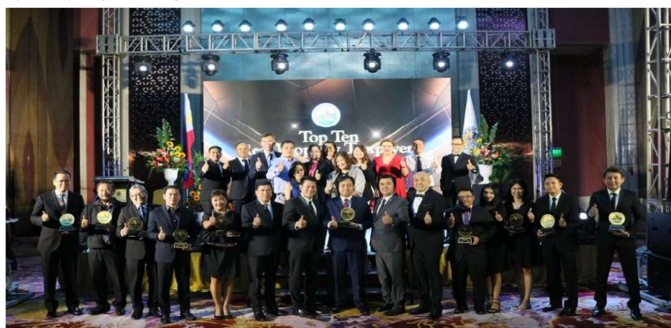
CITY GOVT. OF IMUS:Recognition Night for 2019 Top Ten Business and Real Property Taxpayers held on July 5, 2019 at Okada Manila Grand Ballroom 3.

Cavite Provincial Jail Visiting Area, Trece Martires City. Sixty-nine (69) inmates were confirmed and given ...Page 4