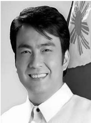
SEN. BONG REVILLA

To strengthen the country's emergency response system during natural and man-made calamities, Sen. Bong Revilla filed a bill seeking the creation of a permanent item for a disaster risk officer in every local government. Because the Philippines is located near the Pacific Region near the equator, an average of 15-