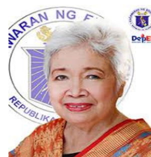
DepEd Secretary Briones

Briones reported that "we have achieved so much in access." However, she admitted that the Department is facing challenges on resources and facilities especially those schools in geographically isolated and disadvantaged