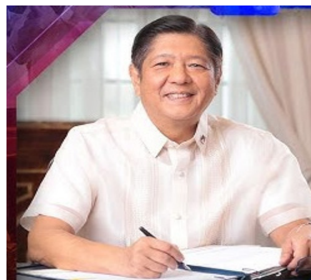
President Bongbong Marcos