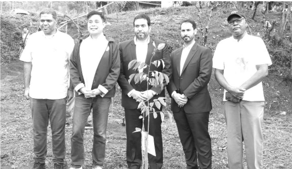
Negotiations are underway between Climate Change Commission and partner countries to gain access to technical capabilities that can be utilized for a scientific approach to combat climate change.