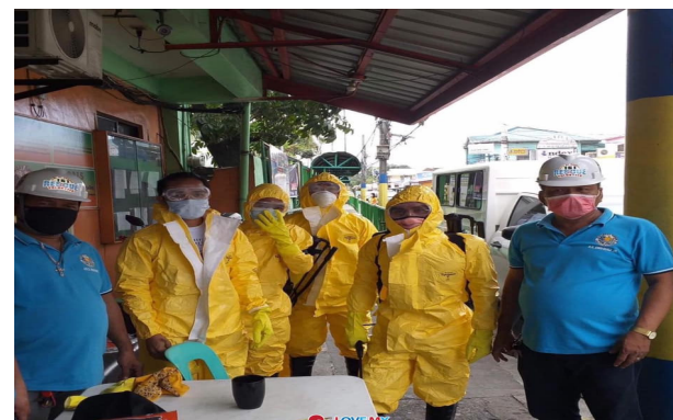
Nagsagawa ng disinfection at fumigation sa Aniban 1 to 3.