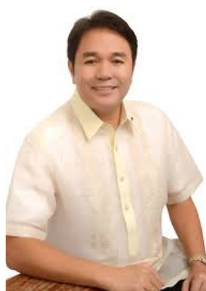
Mayor Edwin Olivarez

In the same special session of the City Council led by Vice-Mayor Rico Golez, the local government passed the Resolution No. 2020-011 ordering the temporary closure of non-essential business establishment, and the 8:00 p.m. to 5:00 a.m. curfew under Ordinance No. 2020-03. (PIA-NCR)