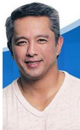
Cavite Governor Jonvic Remulla