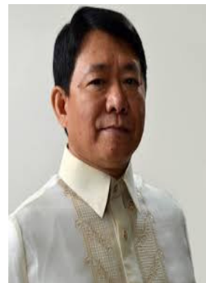
DILG Sec. Eduardo M. Año