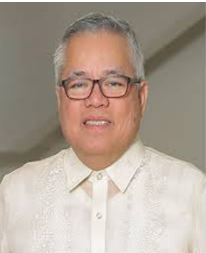
DTI SEC. RAMON LOPEZ crease, transmission happens exponentially," he said. Luzon is home to more than half of the Philippine population.

community quarantine. "Don't panic. There will be food and necessities. (They) are more than enough. No need to panic," he added. Lopez further said enhanced community quarantine aims to further limit people's movement and stop or flatten the spread of coronavirus disease 2019 (Covid-19). "Otherwise, cases continue to in-