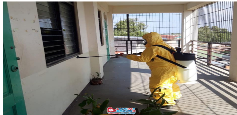
Patuloy ang paggawang disinfection operation sa Barangay Maliksi 1 at sa Bacoar National High School kanina.