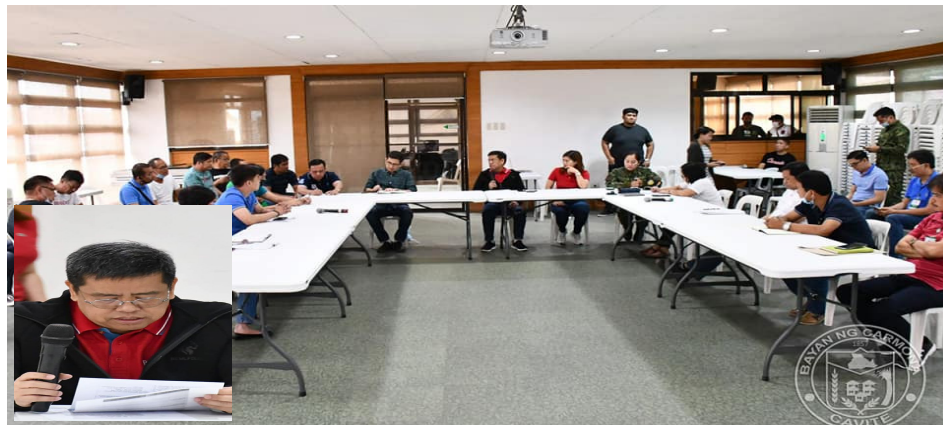
Meeting of the Carmona Inter-Agency Task Force on COVID-19 headed by Mayor Loyola regarding the specific guidelines of the enhanced community quarantine as declared by President Rodrigo Duterte