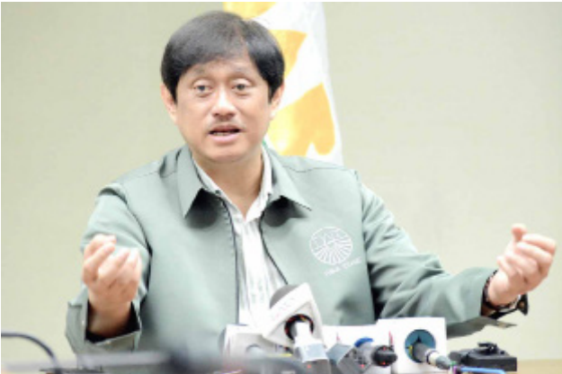
DAR Secretary Conrado Estrella III