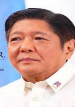
Pres. Ferdinand Marcos Jr.

MANILA – Instead of dragging each other down, President Ferdinand “Bongbong” Marcos Jr. on Monday said the only way to succeed as a nation is to lift each other up by being instruments of peace and solidarity.