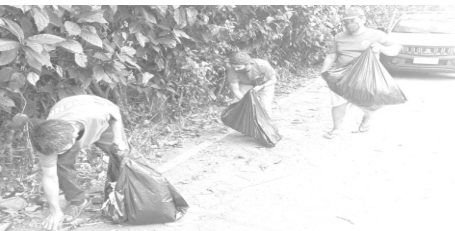
Conducted Weekly clean-up drive (1st week of Feb.)of the employees of the Municipal Environment and Natural Resources Office (MENRO) of the town of Alfonso.