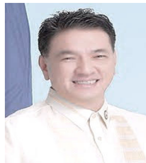
Rep. Strike B. Revilla