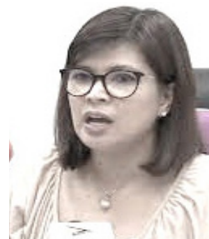
Bacoor City Mayor Lani Mercado-Revilla.