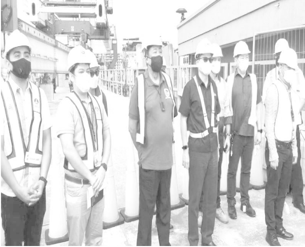
Parañaque City. “I think it’s just appropriate that we salute LRMC. Pinakita ninyo ang pangangailangan na talaga na maganda ang (You have shown the need for good) partnership between the local government, private sector, and the national government,” Tugade said. Phase 1 of the

He thanked the LRMC for continuing the project’s construction amid the Covid-19 pandemic and for the “active” collaboration of the local government of