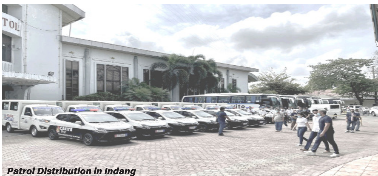
Patrol Distribution in Indang