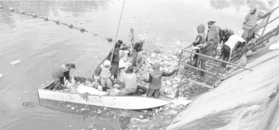
CENRO river warriors recently performed clearing operations at Camella Lessandra 2 and Salinas 1 on Feb 3