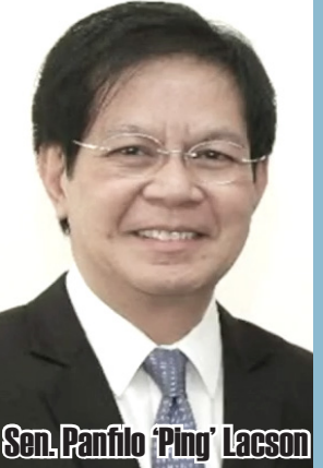
Sen. Panfilo 'Ping' Lacson