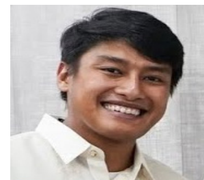
Governor Abeng Remulla