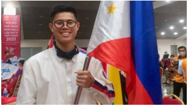
Olympian Ernest John Obiena (File photo)

Legal and Judicial Rate: ADVERTISING RATES Legal Notices P160.00 per col. cm. Commercial Ads P200.00 per col. cm SUBSCRIPTION RATES 1 year- P500.00 6 mos.-P250.00