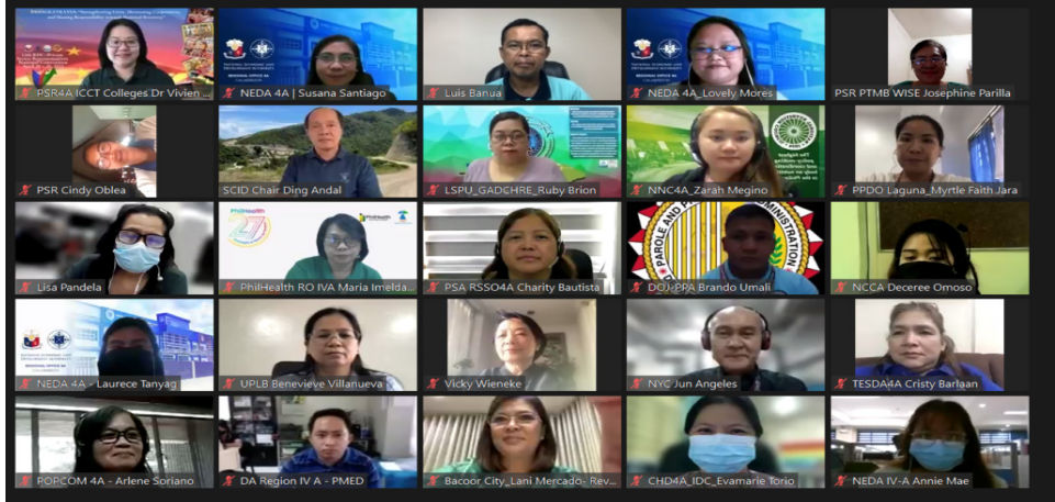
SCSD/SP members and Secretariat during the second quarter 2022 SCSD/SP meeting on May 11, via video conference with Mayor Lani Mercado

Bacoor City implemented various initiatives to address the issues concerning the relocation of ISFs, in line with the Republic Act 7279 or the Urban Development and Housing Act of 1992 and the Supreme Court Mandamus to clean up, rehabilitate and preserve Manila Bay. Among the reported best practices