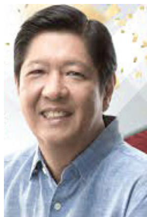
Pres. "Bongbong" Marcos Jr.

Mahigit 2.3 milyong magsasaka ng palay na nakarehistro Registry System for Basic Sectors in Agriculture ang makakatanggap ng Php5,000 tulong pinansiyal mula sa pamahalaan matapos aprubahan ni Pangulong Ferdinand R. Marcos Jr. ang Php12.7 bilyon pondo para sa Rice Farmers Financial Assistance (RFFA) program.