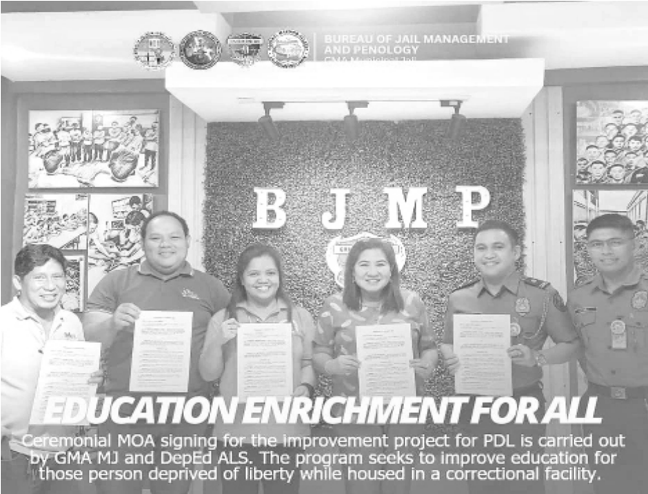
Ceremonial MOA signing for the improvement project for PDL is carried out by GMA MJ and DepEd ALS. The program seeks to improve education for those person deprived of liberty while housed in a correctional facility.