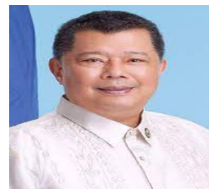
Sec. Jesus Crispin "Boying" Remulla