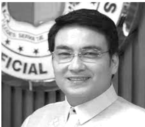
Senator Ramon Revilla Jr.

Senator Ramon Bong Revilla, Jr. sees nothing wrong with Department of Interior and Local Government (DILG) Secretary Benhur Abalos' call for senior police officers to tender their courtesy resignations.