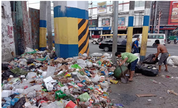
Panapaan 5 papuntang Panapaan 1