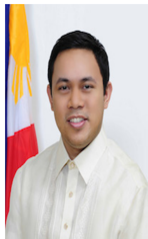
Secretary Mark A. Villar

A safer and faster travel to the Summer Capital of the country is now possible this Christmas season with the opening of the Sison-Rosario segment of the Tarlac-Pangasinan-La Union Expressway (TPLEX) project.