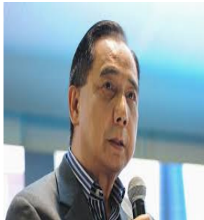
Agriculture Secretary William Dar

Other popular Pinoy fruits include melon, watermelon (pakwan), lanzones, chico, pomelo, rambutan, mangosteen, siniguelas, tiesa,