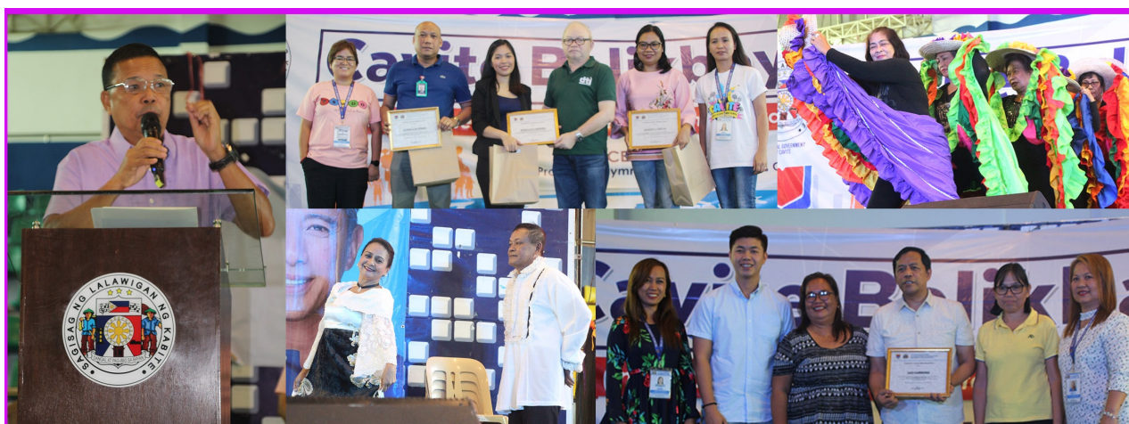
International Migrants Day observance: Provincial Social Welfare and Development Office and Cavite Migration and Development Office celebrated balikbayan Day recently.