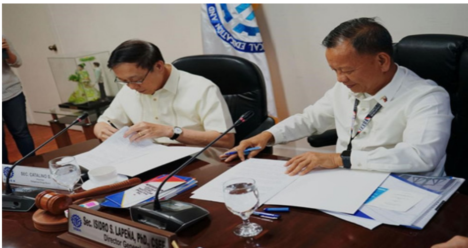
DDB Secretary Catalino S. Cuy and TESDA Secretary Isidro S. Lapeña sign Memorandum of Agreement between TESDA and DDB for "Tahanang Pangkabuhayan" at the TESDA Central Office.