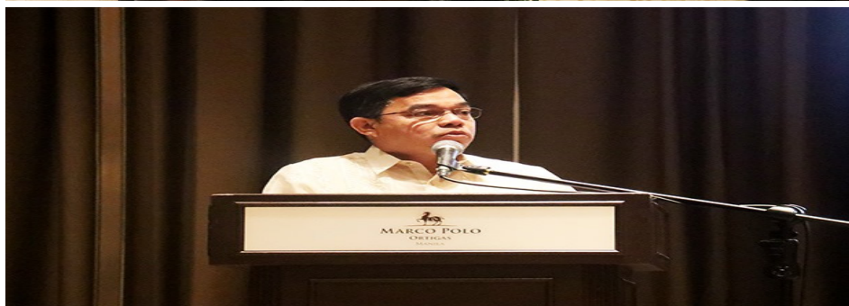
The Department of Education Region IV-A CALABARZON 2019 Gawad Bituin was held last December 16, 2019 @Marco Polo Hotel, Pasig City