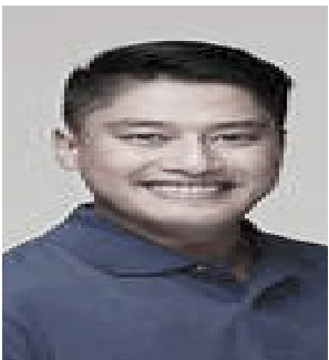
Cavite Gov. Abeng Remulla