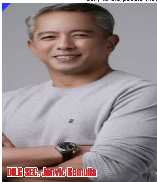
DILG SEC. Jonvic Remulla