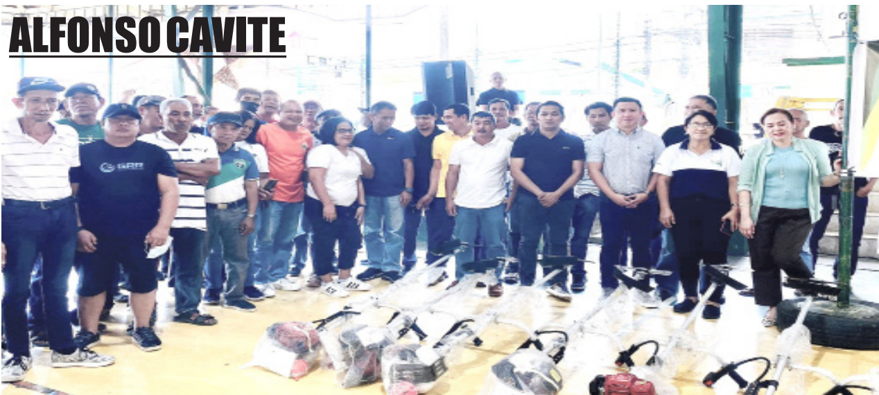
TURN-OVER CEREMONY of AGRICULTURAL MACHINERY & EQUIPMENT UNDER HIGH-VALUE CROPS DEVELOPMENT PROGRAM IN ALFONSO CAVITE HEADED BY MAYOR RANDY SALAMAT RECENTLY.