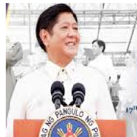
President Bongbong Marcos

LUNGSOD QUEZON (PIA) -- Inaprubahan ni Department of Budget and Management (DBM) Secretary Amenah Pangandaman ang kabuuang halagang P42,931,355,000 upang mapondohan ang health insurance premium ng mga senior citizen sa buong bansa sa loob ng isang taon.