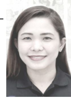
TMC Mayor Gemma Lubigan