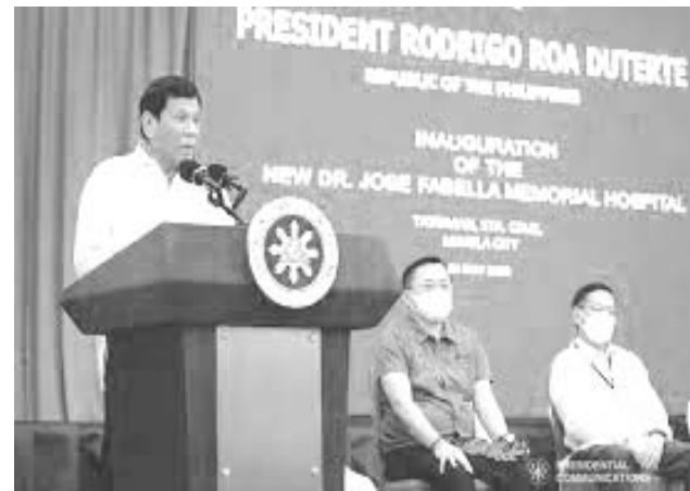
President Rodrigo Roa Duterte delivers his speech during the inauguration of the new Dr. Jose Fabella Memorial Hospital in Sta. Cruz in Manila on May 4, 2022.