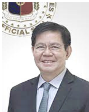
Senator Panfilo Lacson

MANILA – Senator Panfilo Lacson anticipates living a normal life as a civilian in his home province of Cavite in case he does not win the presidency.