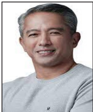
New DILG Secretary Juanito Victor C. Remulla

Opisyal nang nanumpa kay Pangulong Ferdinand R. Marcos Jr. si Cavite Governor Jonvic Remulla bilang bagong Kalihim ng Department of the Interior and Local Government (DILG) nitong araw ng Oktubre 8.