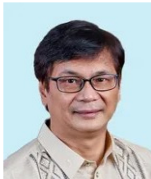
Former DILG Sec. Benhur Abalos

Si Remulla ay pumalit kay Benhur Abalos na nagbitiw upang maghain ng kanyang Certificate of Candidacy bilang senador sa 2025 midterm elections.