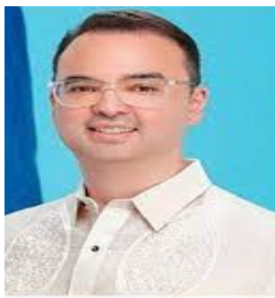
Sen. Alan Peter Cayetano