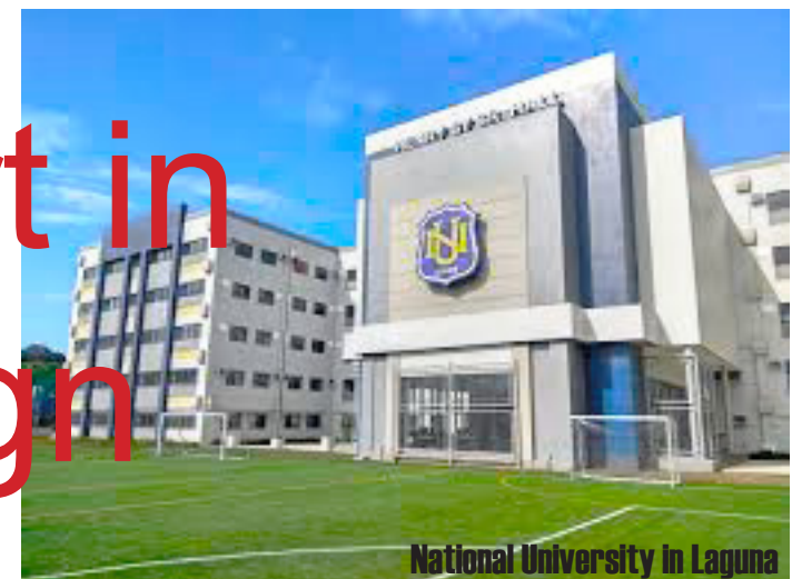
National University in Laguna

The fight against the harsh effects of climate change cannot and should not be shouldered by the government alone, which is why students from the National University in Laguna, in cooperation with the European Chamber of Commerce of the Philippines (ECCP), have launched a program to support the country's goal of achieving net zero by 2030.