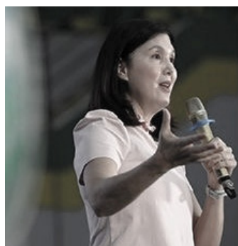
Sen. Pia Cayetano