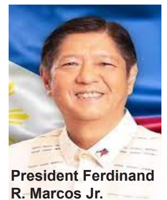
President Ferdinand R. Marcos Jr.

the inauguration of the CAVITEX C5 Link Sucat Interchange, Marcos said he pledged to carry on the building of infrastructure projects that will benefit the economy and the Filipino people through the Build Better More (BBM) program when he