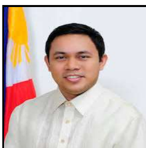
DPWH Secretary Mark Villar

At the groundbreaking ceremony, Public Works Secretary Mark Villar said the project is part of the Duterte administration’s masterplan to connect Luzon from north to south, to be called the “Luzon Spine Expressway Network” (LSEN), to increase the current 300-km. high-speed expressway to 1,000 km. by 2022, the end of President Rodrigo R. Duterte’s term. ...Page 4