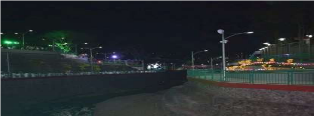
PROMENADE DES DAMSARIÑAS AT NIGHT. Residents of Dasmariñas now have their own public park, named “Promenade Des Dasmariñas”, which is open from 5 a.m. to 12 midnight every day. The park is located at the Riverside along Mangubat Avenue just before gate 3 of De La Salle University (DLSU) in Dasmariñas.

Office Add.: Purok 8, Brgy. San Agustin, Trece Martires City, Cavite Editorial Office: 137 Peter St., Viña Village, Imus City Cavite Tel. No. (046) 970-6105* (046) 571-6020 email address: chroniclecavite@yahoo.com *chroniclecavite@gmail.com