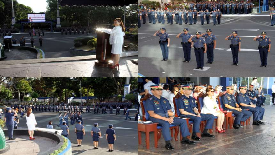
The Philippine National Police recognized policewomen with outstanding accomplishments during the culmination of Women’s Month on March 25, 2019 in Camp Crame, Quezon City.

seminary’s Annual Fides et Ratio Conference on Saturday. Present during the Mass were the seminary formators and staff, parents of the seminarians, and a number of Filipinos working and residing in Miami. Directing his attention to the Filipino community, the cardinal reminded of their “mission” as “witnesses” of Christ. “We should witness to the world wherever we are, don’t be ashamed to tell the world how good God is,” he said. Cardinal Tagle also appealed to the Filipino families to instil in the minds of their children and grandkids the possibility of priestly and religious life vocation. From Miami, the cardinal left for Austria on Monday for a meeting of international Caritas representatives and the ongoing Humanitarian Congress.