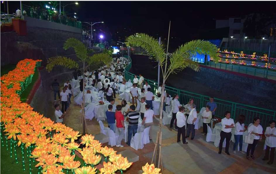
PARK OPENING - Photo taken during the public launch last March 26, attended by city officials led by Mayor Elpidio “Pidi” Barzaga, Jr., with Cavite 4th District Representative Jennifer “Jenny” Barzaga.

now sprawling with landscaped garden, a fountain, cabanas/gazebo and an eye-catching cascading waterfall where each part is “selfie” worthy or “instraggamable” -- as how the generation now refers to beautiful places worthy of their self-portrait for sharing in social media. This “urban” garden aims to bring back the old “promenade” concept, thus the name where people can take a leisurely public walk, bike ride, to meet or be seen by others, Alano said. It is open to public from 5 a.m. to 12 midnight every day “ideally for Dasmarineños for now,” and equipped with high definition close circuit television (CCTVs) and with six security personnel making rounds from 6 p.m. to 12 midnight to ensure the public’s safety. “The park will encourage and inculcate to the visitors the virtue of discipline as there will be no trash bins placed within the park premises “so the CLAY GO (Clean As You Go) will be strictly observed and enforced,” Alano said. Bathing in the fountain area is also be prohibited. This public park reconfirms anew the unparalleled leadership of Mayor Elpidio “Pidi” Barzaga Jr. and his equally hardworking wife, Cavite 4th District Rep. Jennifer “Jenny” Barzaga, whose efforts continue to make the city landmark of progress and excellence in nation-building. (PNA)