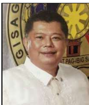
Cavite Governor C. Remulla