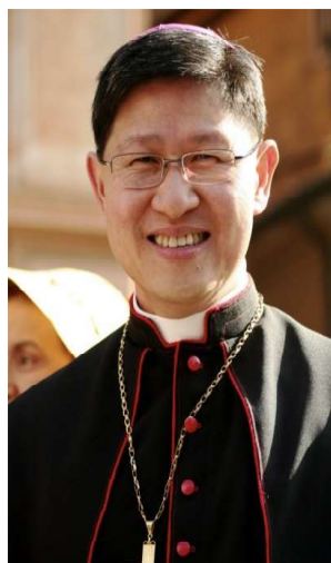
Cardinal Luis Antonio Tagle

Cardinal Luis Antonio Tagle of Manila visited the U.S. over the weekend and warned Florida seminarians about temptations “that makes you messianic”.