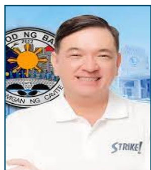
City Mayor Strike B. Revilla

Bacoor City- The City Government of Bacoor, in partnership with Barangay Molino 3, held Cont. on PAGE5