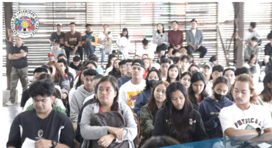
ATIN 'TO! AT YOUR SERVICE