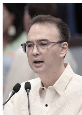
Senator Alan Peter Cayetano

Speaking during the final reading of Sen-