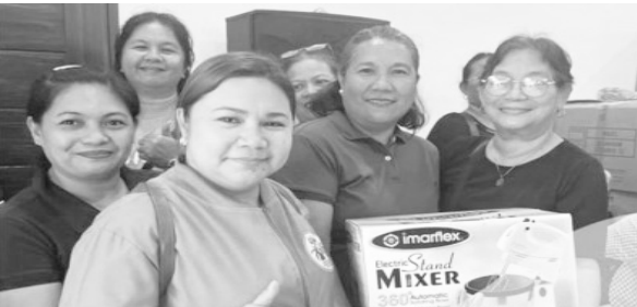
LIVELIHOOD AID. The Department of Labor and Employment (DOLE) Cavite Provincial Office has granted livelihood packages worth PHP2 million to seasonal workers on Sept. 10 and 11, 2024 at its office in Dasmariñas City. Some parolees also received assistance packages worth PHP591,395 in Imus City on Sept. 10.