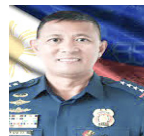
(PNP) chief Rodolfo Azurin Jr.