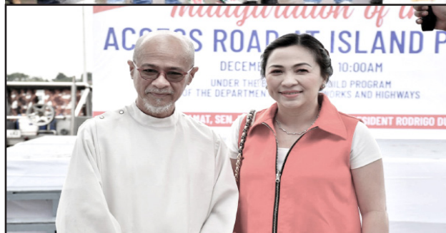
INAUGURATION OF ACCESS ROAD at Island Park, Governor's Drive Dasmaringas Cavite with Governor Jonvic Remulla, Rep. Pidi Barzaga and City Mayor Jenny Barzaga on December 9, 2022.

TRECE MARTIRES CITY - Apat (4) na kandidato mula sa mga sikat at kilalang angkan ng mga pulitiko sa lalawigan ng Cavite ang naghain ng kanilang Certificate of Candidacy (COC) noong nakalipas na Disyembre 5 at 6, 2022.