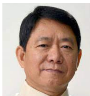
Eduardo Año as the new NSA

MANILA — President Ferdinand R. Marcos Jr. has appointed Eduardo Año as the new National Security Adviser (NSA), Malacañang announced on Saturday. Presidential Communications Office Secretary Cheloy Garafil confirmed Año's appointment after the oath-taking at the Palace on Saturday.