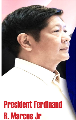
President Ferdinand R. Marcos Jr

March 21, 2025 – President Ferdinand R. Marcos Jr. led an inspection of the ongoing construction of the Cavite-Laguna Expressway (CALAX) Governor's Drive Interchange, reaffirming the administration's commitment to enhancing the country's road infrastructure.