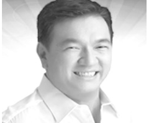
Rep. Strike B. Revilla

Bacoor City, Cavite (PIA) – The city government of Bacoor thru the Social Housing Finance Corporation (SHFC) held the turn-over ceremony of the initial 200 housing units in