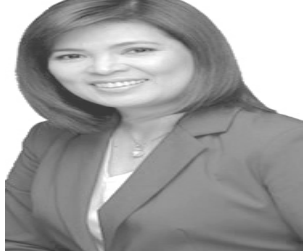
Mayor Lani Mercado-Revilla

Bacoor City, Cavite (PIA) – The city government of Bacoor thru the Social Housing Finance Corporation (SHFC) held the turn-over ceremony of the initial 200 housing units in