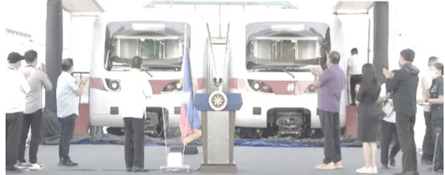
President Rodrigo Duterte during the unveiling of new Metro Rail Transit Line 7 (MRT-7) train sets in Commonwealth, Quezon City on Dec 16.

MRT Line 7 is a 24.7 kilometer railroad project which runs from North Avenue in Quezon City and ends in the City of San Jose del Monte in Bulacan.