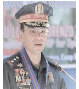
Gen. Guillermo Eleazar

"Kung sa bukana pa lang ng police station ay makikita na ang nagkalat na upos ng sigarilyo at basurang nagkalat, at kung sa bukana pa lang ay mapanghi na ang simoy ng hangin, mahihirapan tayong makuha ang respeto at tiwala ng ating mga kababayan na ating pinagsisilbihan (If at the entrance of the police station, we will see scat-