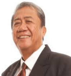
Transportation Sec. Arthur Tugade

it said, will also allow the LTO Cavite District to serve more clients through its enhanced operational capacity.