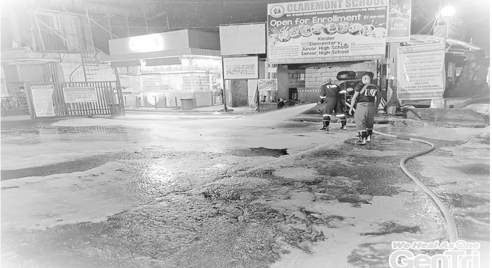
The Bureau of Fire Protection of the City of General Trias continues to disinfect public areas as part of the campaign against COVID-19 yesterday May 10.

The LTO Imus district office began operations in 2018 and has served clients for two and a half years before the increasing demand necessitated the construction of a new office building.