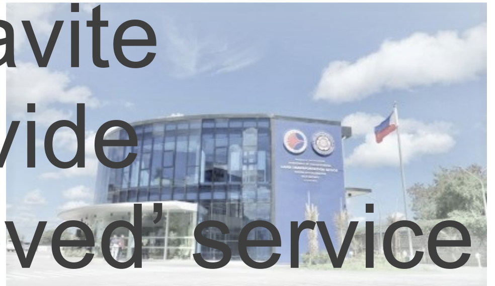
LTO CAVITE. The facade of the newly-inaugurated district office of the Land Transportation Office (LTO) in Imus, Cavite. The LTO on Wednesday (May 12, 2021) said the new office will provide a "much-improved" service to a greater number of clients.