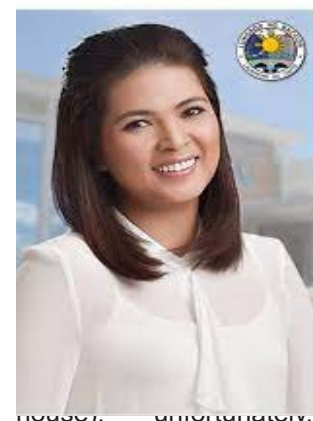
Mayor Lani Mercado