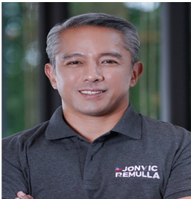
Cavite Governor Jonvic Remulla

To protect the public, the labor department's Bureau of Local Employment brought the complaint to the Enforcement and Investor Protection Department of SEC for further investigation. source:(DOLE)