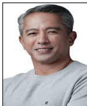
New DILG Secretary Juanito Victor C. Remulla

"The L-1-CE Project has been a long time in the making—spanning five admin-