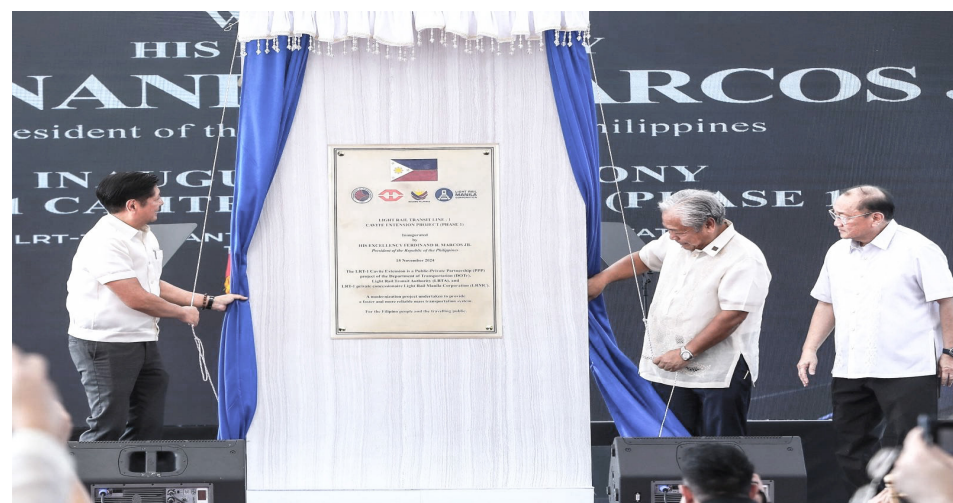
President Ferdinand R. Marcos Jr. leads the inauguration of the Light Rail Transit Line 1 (LRT-1) Cavite Extension Project Phase in Parañaque City on Friday (Nov. 15, 2024).