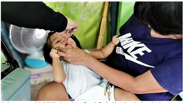
A three-year old child being given Patak Polio Vaccine during the house-tohouse immunization campaign in one of the barangays in the province of Cavite on August 17, 2020

There are 13 reported polio cases on the country