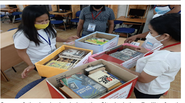
Some of the books lended at the City Isolation Facility for the Covid-19 patients for the Project "Book Saves".

"BIDA ang may Disiplina: Solusyon sa COVID-19" is a national advocacy campaign jointly implemented by the DILG and Department of Health brought forth by the goal of encouraging people participation in the battle against COVID-19 by living a life of discipline and earnestly practicing the minimum health standards set by health authorities.