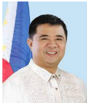
Imus City Mayor Alex "AA" Advincula

IMUS CITY, Cavite (PIA) — Residents of Imus City can now have improved access to healthcare services with the opening of the Department of Health's (DOH) Super Health Center in Barangay Carsadang Bago 1 in Imus, Cavite.