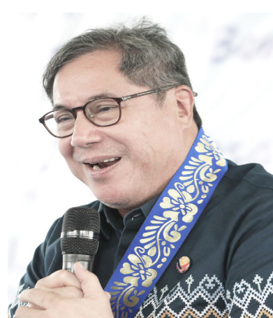
Health Secretary Teodoro Herbosa

IMUS CITY, Cavite (PIA) — Residents of Imus City can now have improved access to healthcare services with the opening of the Department of Health's (DOH) Super Health Center in Barangay Carsadang Bago 1 in Imus, Cavite.