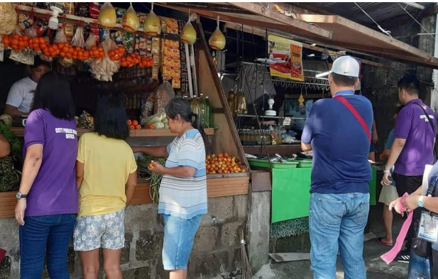
Patuloy ang Operation Timbangan ng Treasury Office at City Public Market Office nitong hlinggo sa Justinville Subdivision Talipapa sa Barangay Panapaan VII, Perpetual Village VII Talipapa sa Barangay Mambog V, at Salinas Urban Talipapa sa Barangay Salinas I.