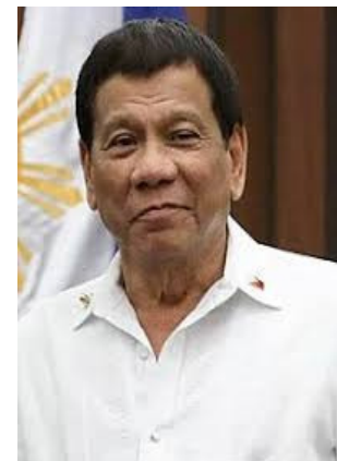
President Rodrigo Roa Duterte

“I’m pleading na huwag kayong gumawa. Do not do anything that will jeopardize the relation at