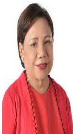
Sen. Cynthia Villar