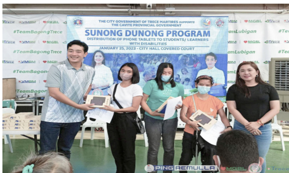
Pamamahagi ng phone tablets sa 29 students/learners with disabilities na ginanap sa City Hall Covered Court, Trece Martires City noong Enero 25.