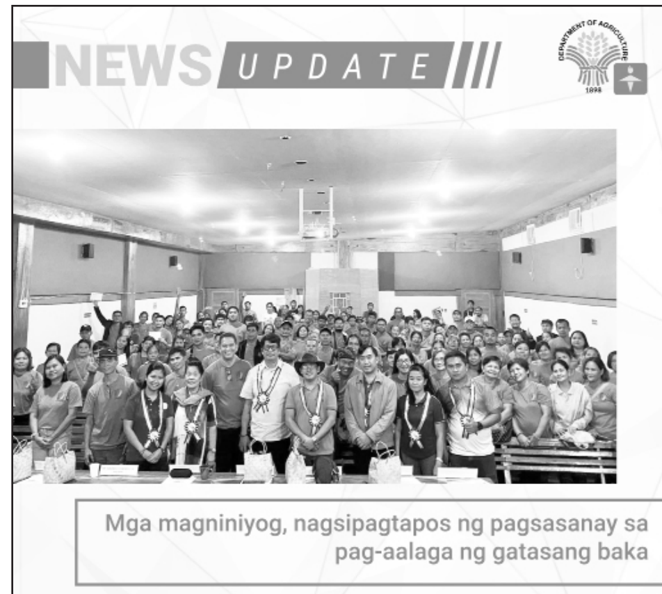
Mga magniniyog, nagsipagtapos ng pagsasanay sa pag-aalaga ng gatasang baka

Pinangunahan ang pagsasanay ng DA-ATI CALABARZON, katuwang ang DA Regional Field Office (RFO) IV-A, National Dairy Authority (NDA) South Luzon, at Philippine Coconut Authority (PCA) IV.