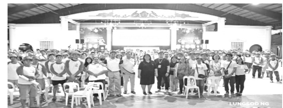
Disadvantaged/Displaced Workers (TUPAD) in Carmona City