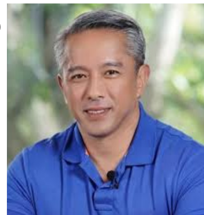
Governor Jonvic Remulla

With its initial offering, Botika on Wheels team visited 27 barangays of the Municipality of Maragondon from June 5 – 11, 2020 and distributed free maintenance medicines to a total of 2,260 senior citizens as well as vitamins to help boost their immune system. On the other hand, the mobile drug store dispensed medicines to 4,364