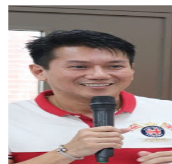
Mayor Emmanuel Maliksi

IMUS CITY, Cavite (PIA) -- The local government here thru the Department of Education-Imus have been preparing for the School Year 2020-2021 which opens August 24, 2020 with the New Normal setting.