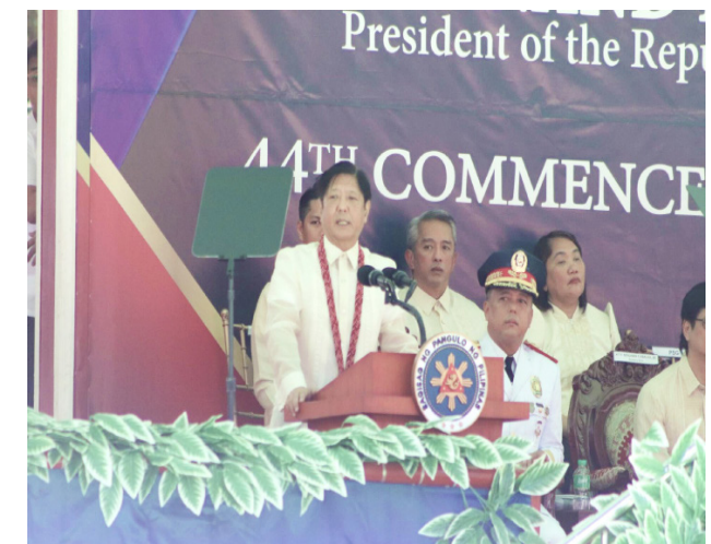
President Ferdinand R. Marcos Jr. leads the 44th Commencement Exercises of the Philippine National Police Academy (PNPA) with the MASIDTALAK (Maaasahang Tagapagsilbi ng Inang Bayan na may Dangal at Katapatan na ang Layunin ay Kapayapaan) Class of 2023 at the Camp General Mariano Castañeda in Silang, Cavite on March 10, 2023.

The President, who was an honorary member of the TAG-