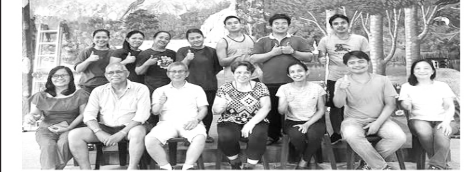
ons to our five (5) newly certified PGS farms n CALABARZON. Your efforts and dedication for the development and further improvement of organic ure sector in the region are truly apprec

Sites for Agriculture (LSA). These include: Chad's Nature Farm from High Woods, Ole Farm Well from Padre Garcia, RLI Fruit Farm from Bauan, and Iglesias Farms from Malvar. Furthermore, the owner of Paanyaya Farm from San Jose graduated the training also conducted by DA-ATI CALABARZON.