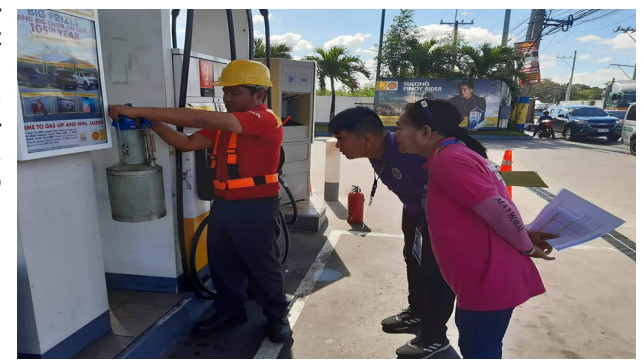
SC Lacson Total, Molino Daang Hari, Molino IV; CHL Petron, Molino IV; Flying V, IV; DNM Fuel Service Shell, FV Marketing, Molino Road, Georgetown Heights.

Nagsagawa ang City of Bacoor ng calibration sa iba't ibang gasoline stations upang masiguro na tama ang sukat ng mga gasolina at diesel na ikinakarga sa ating mga pampubliko at pribadong sasakyan. Nagtungo ang mga kawani mula sa pamahalaang lungsod ng Bacoor sa APD Trading Jetti, Bayanan; Cheribum Shell, Molino IV;