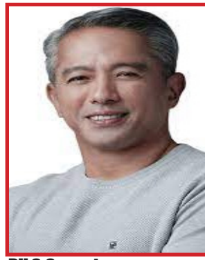
DILG Secretary Juanito Victor C. Remulla Commission on Elections, saying that this should go hand in hand with a Kontra Tanggap drive. "Dalawa dapat 'yan eh, campaign Kontra Bigay at campaign Kontra Cont. on PAGE 4

during a press conference in Baguio City as part of his visit to Police Regional Office-Cordillera Administrative Region in La Trinidad, Benguet last Wednesday. He cited the Department's efforts in filing cases against rogue members of the PNP tagged in the 990 kilo drug haul in Manila in 2022. "Yung mga kaso na 'yan ni-review ko kaagad at ngayon nakakulong na sila, so I will not hesitate," he said. Meanwhile, he said he fully supports the "Kontra Bigay" campaign spearheaded by the